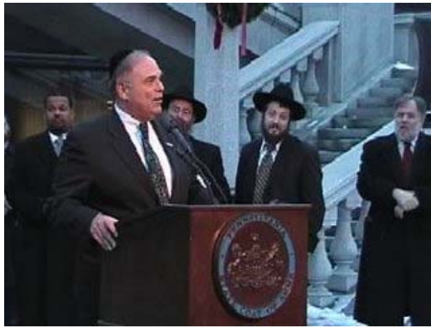
Governor of Pennsylvania Edward G. Rendell

... with yet another member of the Chabad Lubavitch.